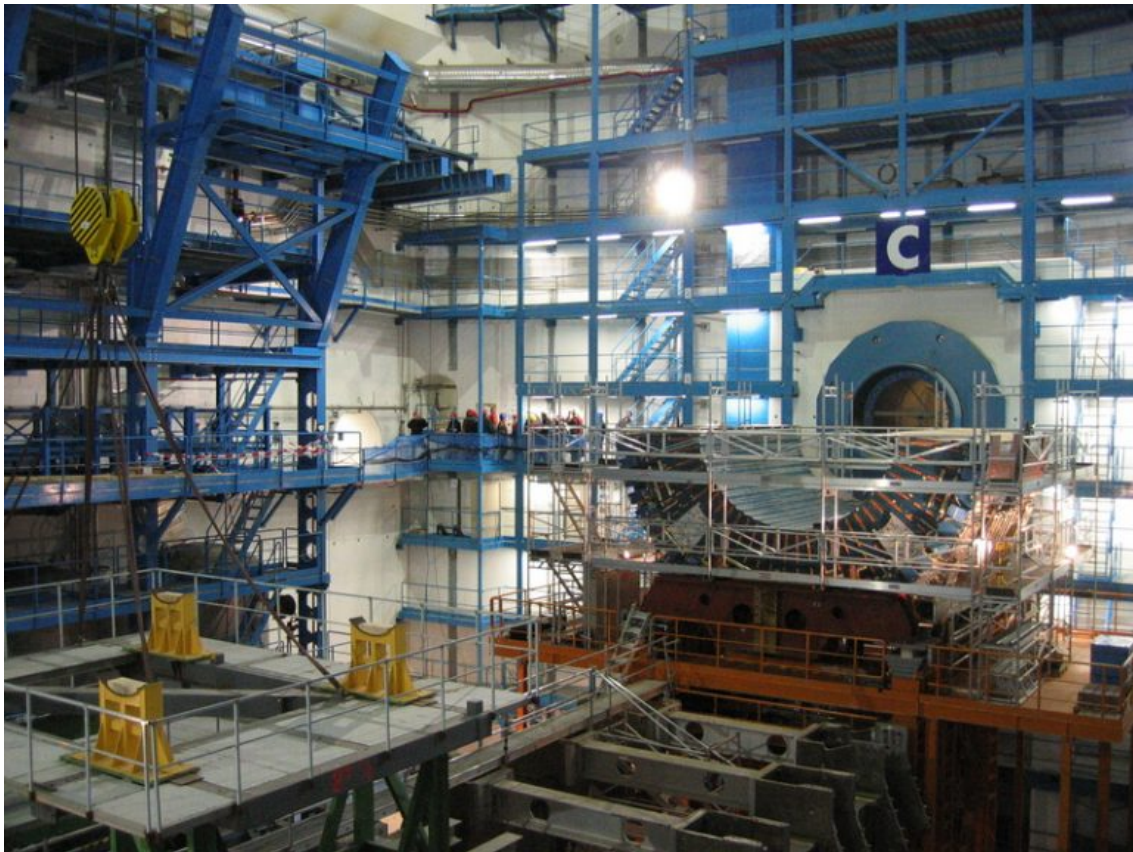
ATLAS experiment detector under construction in October 2004 in its experimental pit; the current status of construction can be seen on the CERN website.[1] Note the people in the background, for comparison.

Coming back to your question, we are working together with other communities and sharing as much as we can! Different communities in the high energy physics (HEP) sector have meetings and conferences to share their experiences, knowledge, and research with other teams. I don't think there is anything unique in the way we are doing Open Data and Open Source, in fact, it is this constant feedback between communities that helps to find common frameworks, platforms and even ways to develop and deploy resources. Our community is global and our audience is global, but the approach is in fact local. It is important for us to understand the difficulties and limitations in each region: it is not the same to teach HEP to students in the United States to those in Venezuela. The languages, resources, culture, and differences in the academic systems are now part of our fine tuning when writing projects and documentation.